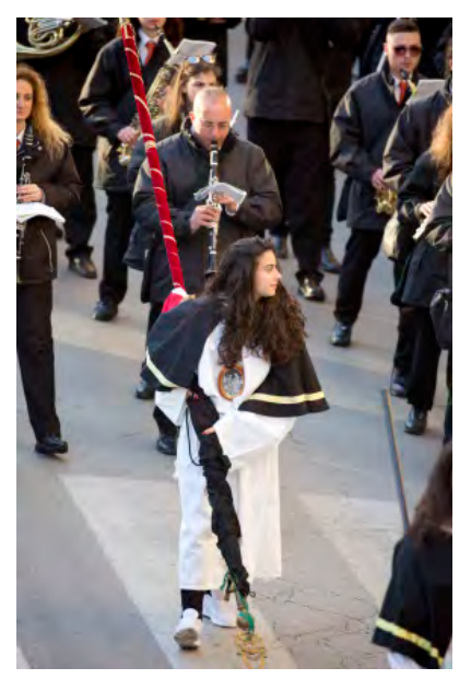
Celebration of Holy Week in Caltanisetta